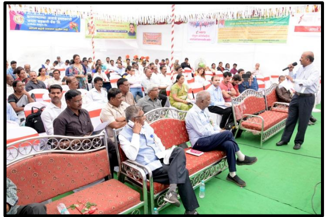
Discussing with participated professors