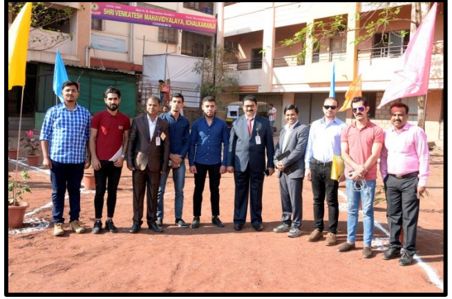
Presence of Foreigner Experts