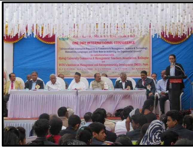
Foreigner experts thoughts